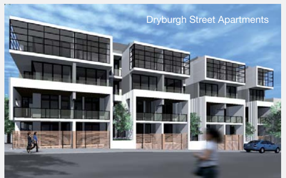
Dryburgh Street Apartments

An exciting new residential development is planned for the increasingly popular inner suburb of North Melbourne. Stralliance is a joint venture partner in the four level, 31 apartment complex to be built on the site of the existing Oz Hotel. Designed by renowned architects Fender Katsalidis, the building will offer a range of one and two bedroom apartments, seven terraces plus a penthouse apartment on the top level. With the permit application lodged, we now await planning approval. Construction is anticipated to begin in early 2011.