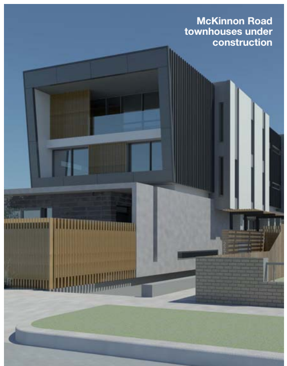
McKinnon Road townhouses under construction