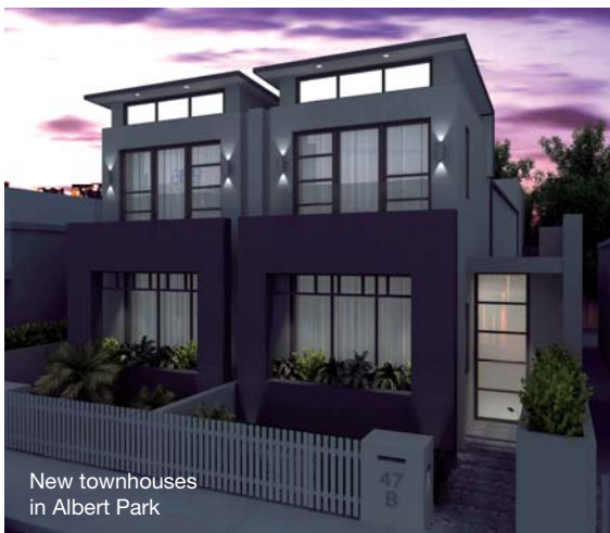
New townhouses in Albert Park

Currently under construction in this sought-after suburb are seven townhouses, each with three bedrooms and either one or two basement car parks. The three-storey project is architecturally designed, with luxury fittings and fixtures. The townhouses are due for completion around March/April 2011.