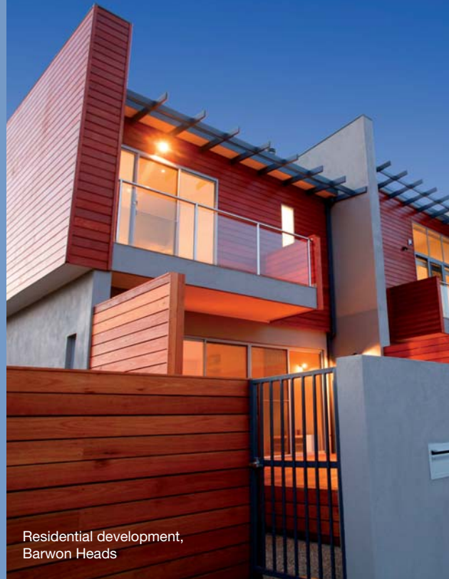
Residential development, Barwon Heads

Watersun Homes is currently building 20 homes in Bendigo of which five are for the Victorian Government's Department of Housing.