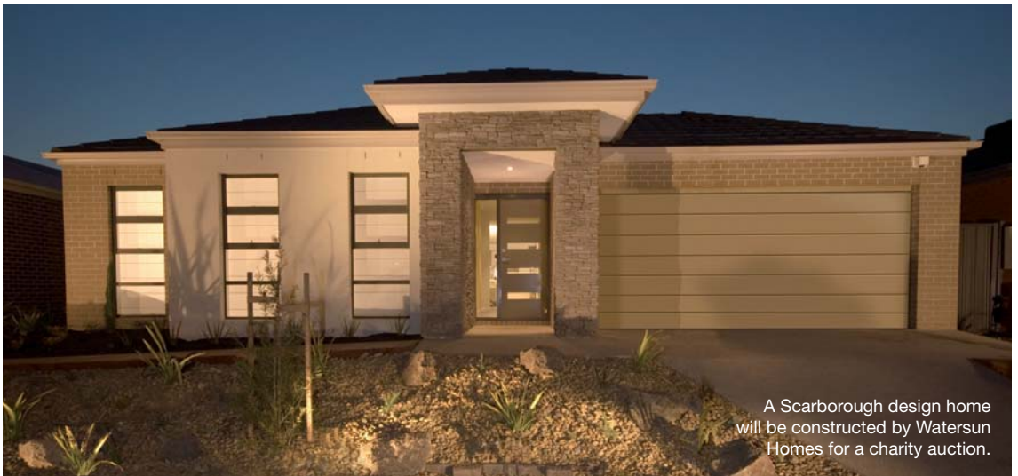
A Scarborough design home will be constructed by Watersun Homes for a charity auction.